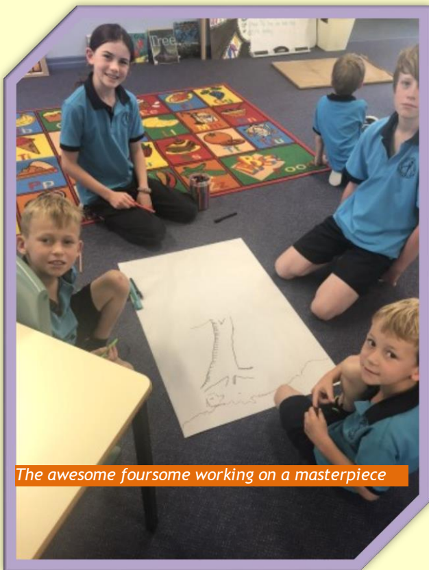
The awesome foursome working on a masterpiece